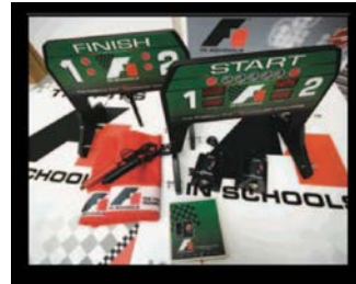
Formula One Car kit